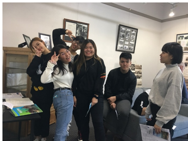
Robe, Information Centre

At the end of this trip, I have gained a lot of new knowledge about the Chinese contribution to Australia, and I was so pleased that our culture can get along with western culture. I am so happy to be a Chinese person, and I am proud. Being a Chinese student in Australia, I felt that I should have known about Australia's Chinese cultural heritage. It was a memorable 5 days trip: no matter about learning about the Gold Rush, I also enjoyed spending time with my friends and teacher for 4 nights in the same cabin. I am so grateful that I could be involved in the Chinese class and got to know about the Chinese legacy in Australia.