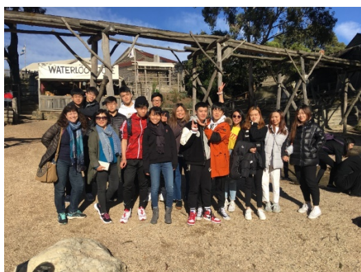
Sovereign Hill, Group photo next to the stream

we went to a remarkable light show at Sovereign Hill. In the beginning, we watched a 15-minutes 3D video which explained the aboriginal legend about Bonjil and how gold was created and throughout, the lightshow demonstrated how miners from around world got along and their lives during the Gold Rush. However, it didn't talk much about the Chinese; it only told us that Chinese walked 400km from Robe, and they were exhausted, and they wished that they could go home with pride having made a lot of money pride.