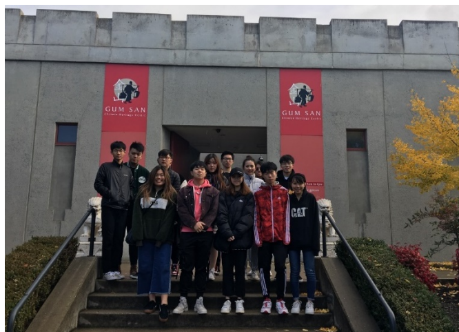
Ararat, Gum San Chinese Heritage

The last day, we went to Ararat, the city that was discovered by the Chinese, but there are no Chinese people in Ararat now. We went to the Gum San Chinese Heritage Museum. This museum shows the influence of Chinese culture on the economic, cultural and social development of Australia. Many Chinese customs and superstitions are catered for in the design of the building. The museum also gave us so much information about the life after the Gold Rush, and also demonstrated the lifestyle they have left. Then we have left this city and spend our last night at Horsham.