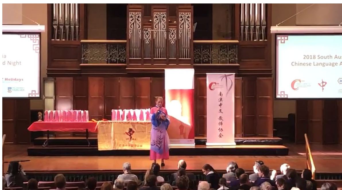
(Resource: 2018 CLTASA Chinese Language Award Night)

The winner schools will receive certificates and awards. Winners will be announced in Term 4, and the winners are invited to Chinese Awards Ceremony to receive the awards.