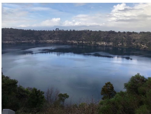
Mt Gambier, Blue Lake

The next day, we start our journey by visiting a picturesque lake – Blue Lake. It was originally a volcano, and it is so amazing how it turned into a beautiful lake. However, it wasn't really blue when we went there, and apparently it will only look blue from November to early January. Then, we left and went to our next location – Ballarat. On the way to Ballarat, we went to Port Campbell, then along the Great Ocean Road where we saw the 12 Apostles. Those landscapes that I saw were spectacularly gorgeous. At Port Campbell, the view was panoramic and breathtaking. Then we drove to Ballarat, a city