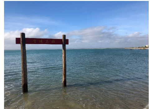
Robe, Friendship Welcoming Pai

The first day we drove for about 2 hours to Chinamen's Well which is in Coorong National Park, then for another 1 hour to Robe which located on the Limestone coast in South Australia. These two locations have a memorable history, especially Robe. Chinese people departed from Hong Kong and were forced to arrive in Robe and walk 400km to Ballarat if they were to avoid a poll tax imposed by the Victorian government. When we visited the information centre, the staff explained a little bit of the Chinese people's history, and also promoted Robe to us.